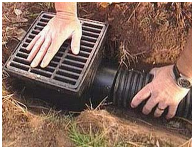
Catch basins and drain tile capture rainwater from downspouts and direct it away from foundations.

If water accumulates around your home, it could cause foundational abnormalities that cost a lot to fix. Properly designed drainage can protect your home from wet basements and flooding by moving water away from your foundation. Standard installation products include catch basins and drain tiles that help move water to desired locations.