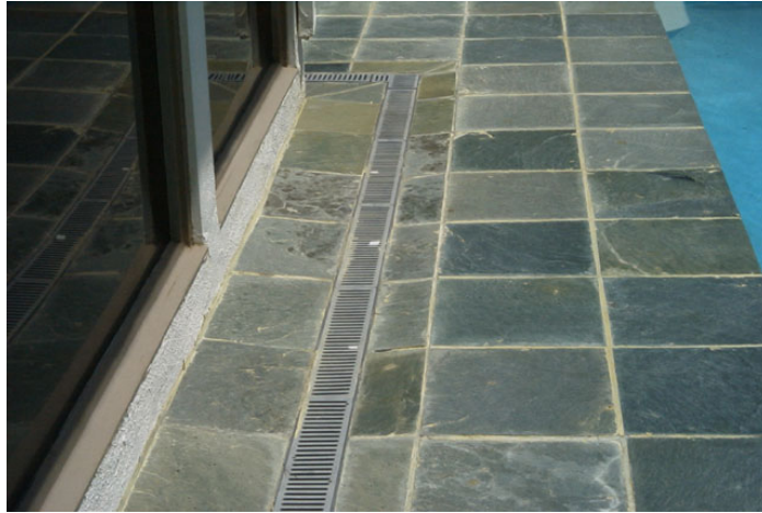
Channel drains prevent pooling of water on patios, driveways and pool decks.

Water drainage for patios and driveways is also very important. Puddles on a patio or driveway are more than inconvenient or unattractive, they can be a sign that the base material underneath the paved surface is breaking down and further settling may occur. Channel drains and other drainage systems can preserve the integrity of your natural stone or concrete patio or driveway by getting rid of excess water. These products meet local regulations while helping to maintain a cleaner environment and water table.